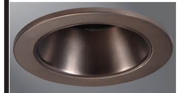
3007TBZ Tuscan Bronze with Tuscan Bronze Reflector