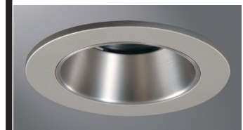
3007SN Satin Nickel with Satin Nickel Reflector