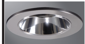
3007PCC Polished Chrome with Specular Clear Reflector