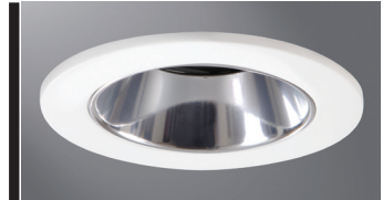
3007WHC White with Specular Clear Reflector

Lamp Aperture: 2" [51mm] Reflector Diameter: 3" [75mm] Ceiling Opening: 3-3/4" [95mm] Outside Diameter: 4-1/4" [108mm]