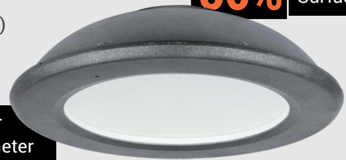
TopTier Nano (D0-D3)