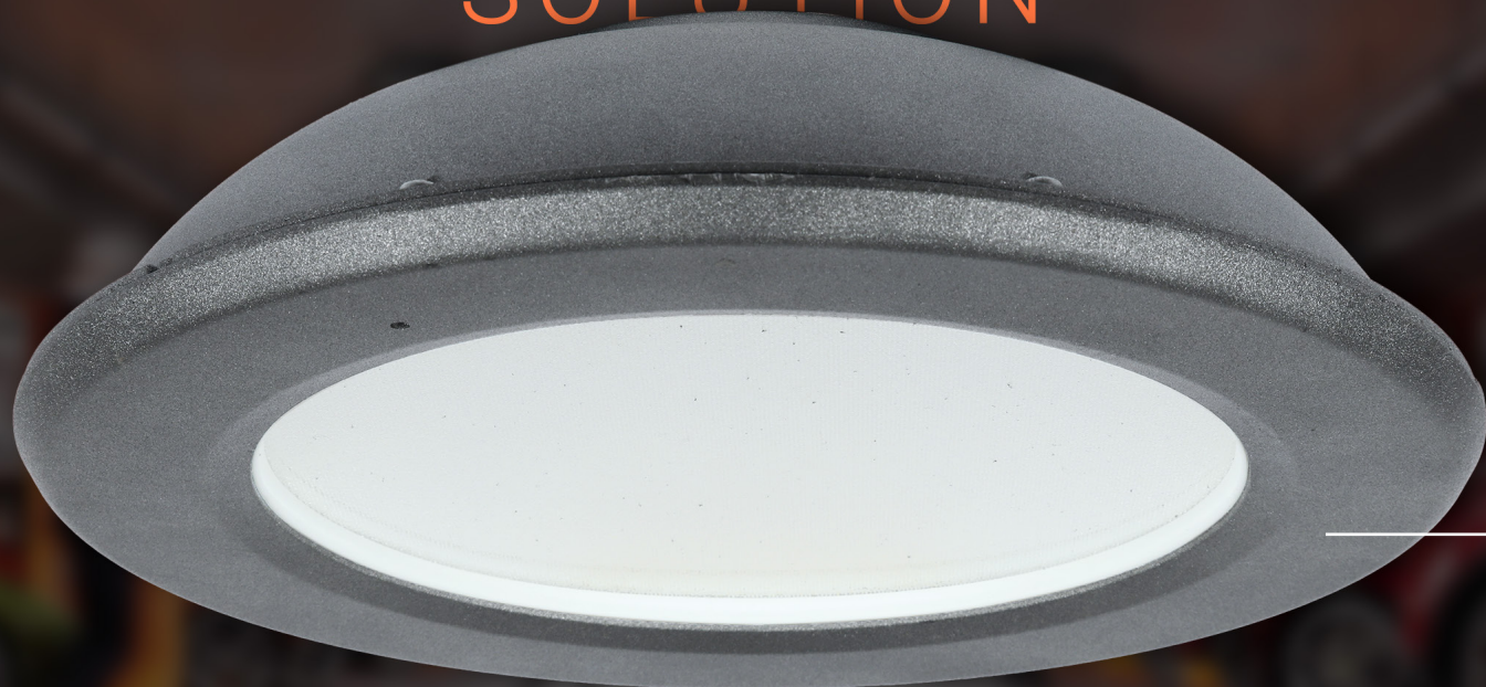
TTN TopTier Nano

Superior optical performance, visual comfort and versatility .