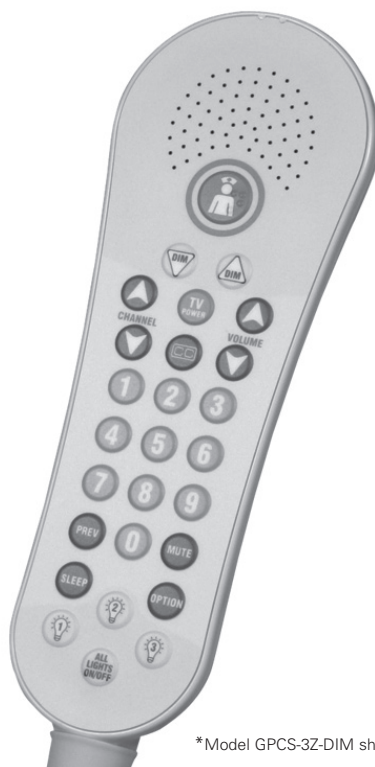
*Model GPCS-3Z-DIM shown