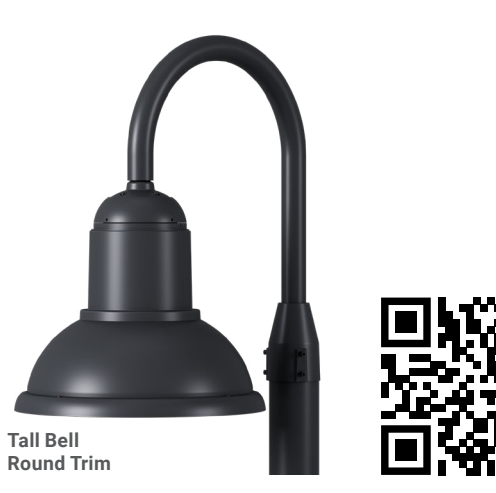
Lexington & Traditionaire

The Lexington and Traditionaire luminaires enhance any street or pathway setting with the heritage charm of traditional lantern style post top lighting. It tastefully complements the architectural and environmental design needs of parks, campuses and residential streets.