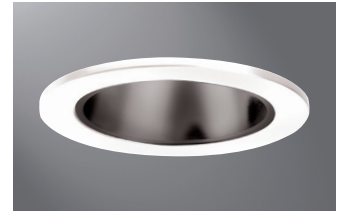
999MB White Trim with Specular Black Reflector