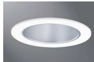
999H White Trim with Haze Reflector