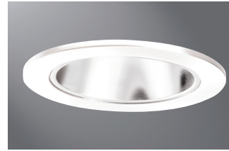
999P White Trim with Clear Specular Reflector