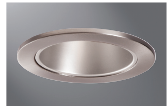
999SN Satin Nickel Trim with Satin Nickel Reflector