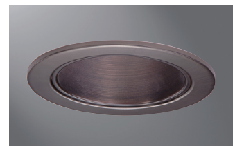
999TBZ Tuscan Bronze Trim with Tuscan Bronze Reflector