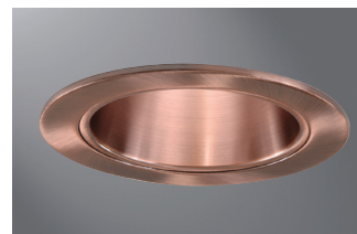
999AC Antique Copper Trim with Antique Copper Reflector