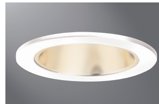
999RG White Trim with Residential Gold Reflector