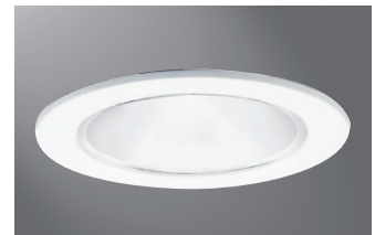
999W White Trim with White Reflector