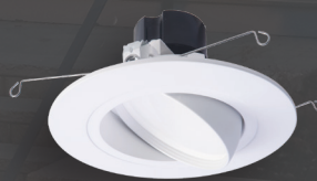
LED Adjustable Downlight