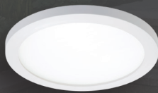
Surface LED Luminaire